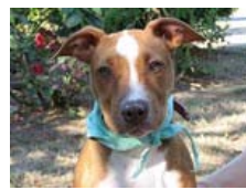
Penelope , a pretty, well-socialized, pit bull puppy, is waiting for a good home through Multnomah County Animal Services