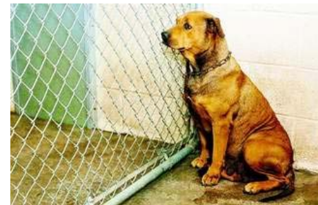
One of the pit bulls that attacked a boy on Monday sits in a cage on Tuesday at the Madison County Rabies Control center.