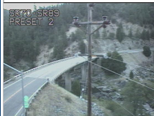
• SR70/SR89 Cam at Greenville Wye - Feather River Canyon