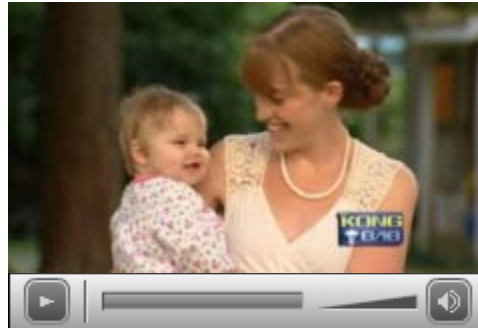
Video: Baby bitten by family dog back home