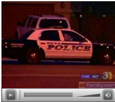
📹 Dog quarantined

MESA -- A family dog attacked and killed a Mesa 2-week-old baby girl when her mother stepped away for just a moment.