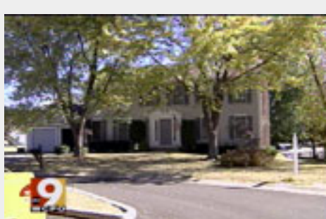
Family hid in rooms upstairs